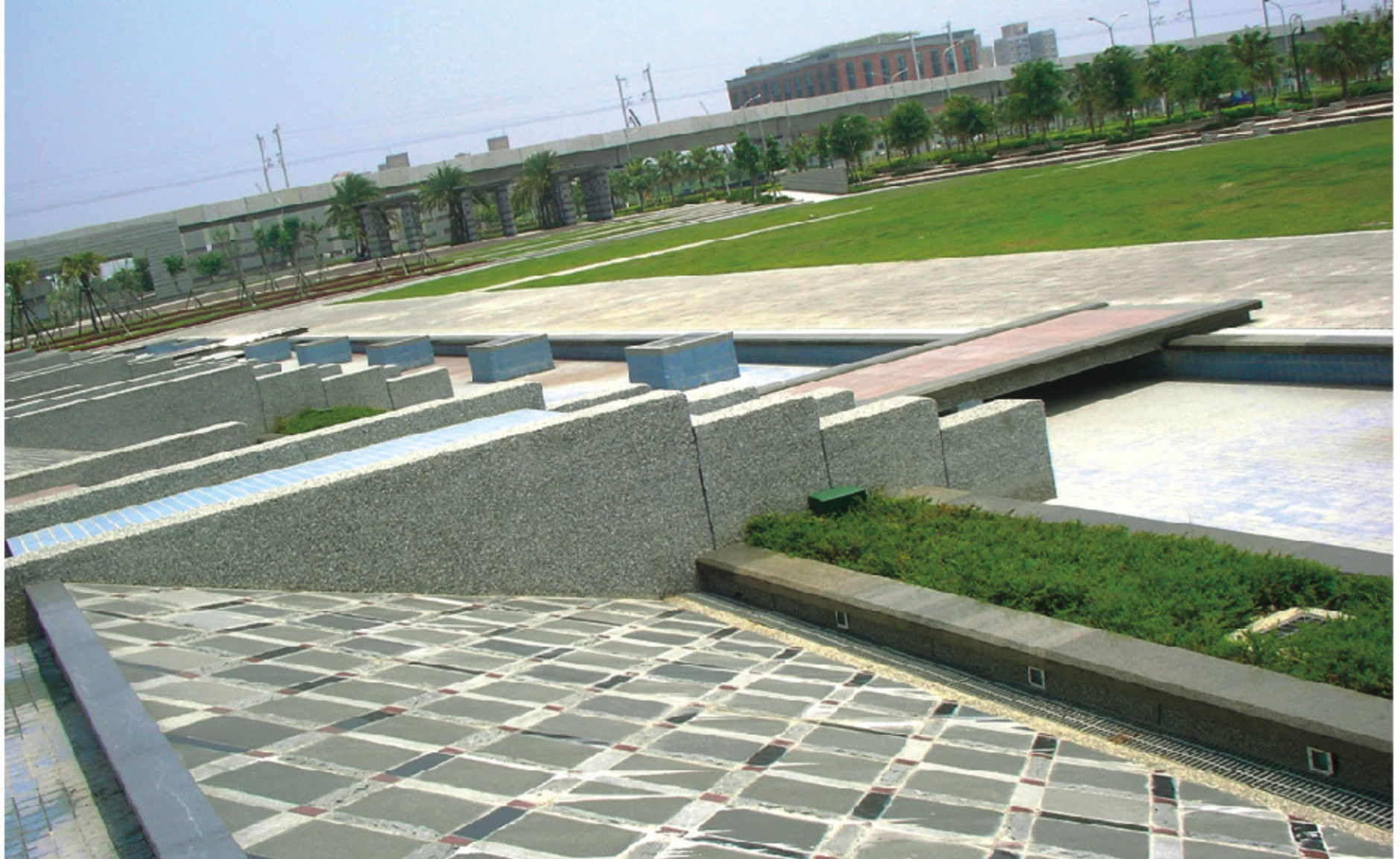
> Siraya Plaza