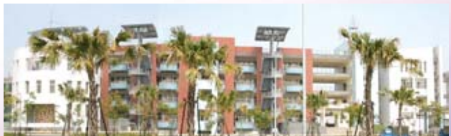
Figure 2-8 Nanke Junior High School