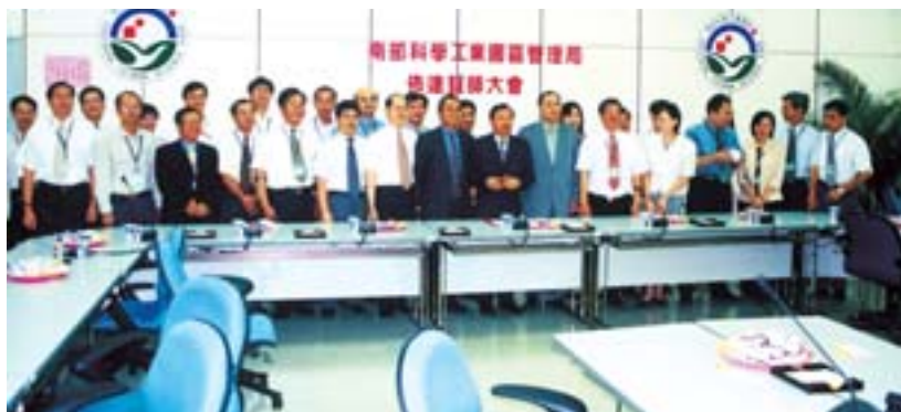
Figure 3-1 New Staff of the STSP Administration Coming on Board

organization of the STSP Administration now is shown in the chart below. The Lujhu Development Office was added to facilitate the development and management of Lujhu Science Park. Since June 2, 2003 the STSP Administration has been functioning under the new organizational framework.