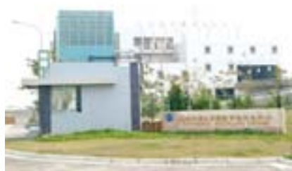
Figure 5-3-2 Resource Recycling Center

A Resource Recycling Center is planned for Tainan Science Park to properly process industrial wastes. In conjunction with park enterprises' construction schedule, the initial stage will include the establishment of storage, materialization, solidification and burial facilities. In accordance with the characteristics of the wastes, an incinerator with a capacity of 80 tons/day and the ability to process hazardous wastes has been established. It began operations in May 2003.