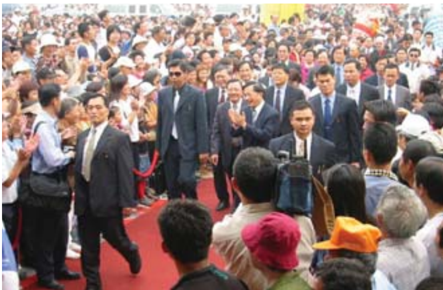
Figure 5-3-11 President Chen Presided over a Road-opening Ceremony