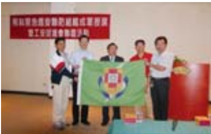
Figure 5-3-5 Emergency Response Team Formed

An Emergency Response Team for the STSP on November 8, 2003 to strengthen regional networks was formed.