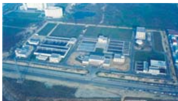
Figure 5-3-1 Environmental Protection Center (Waste Water Treatment Plant)

The Science Park's Environmental Protection Center (Waste Water Treatment Plant) is equipped with facilities capable of handling second degree bio-processing and third degree filtering. In 2003 the waste water treatment capacity was enhanced to 45 thousand CMD. To maintain its audit/inspection credibility and ensure that waste water is properly processed, the Environmental Protection Center (Waste Water Treatment Plant) continues to go through the required audits and inspections to maintain the validity of its certification.