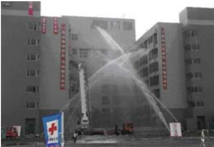
Figure 5-3-4 Fire Drill

Three fire and toxic substance disaster drills were held.