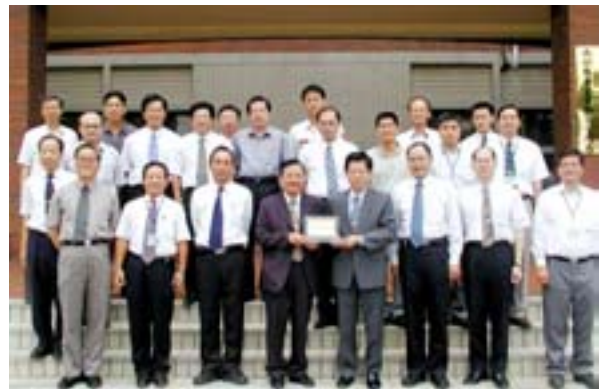
Figure 5-3-6 A Performance Award for Effective Security and Safety

successfully solved 69 cases and arrested 33 offenders; handled 136 traffic incidents and 1,055 violations. They actively participated in community activities and won the tug of war, tennis and golf championships. The park police is the best friend and partner of park enterprises/employees.