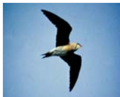
Figure 5-3-3 Large Indian Pratincole ( Glareola Maldivarum )

A 74-acre conservation area has been set aside for Large Indian Pratincole ( Glareola Maldivarum ) to rest and breed. Other habitat preservation measures are being considered and preservation groups are contracted to conduct ecological surveys on a long-term basis.