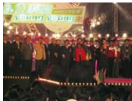
Figure 5-3-13 Energy Technology Young Young New Year's Eve Concert