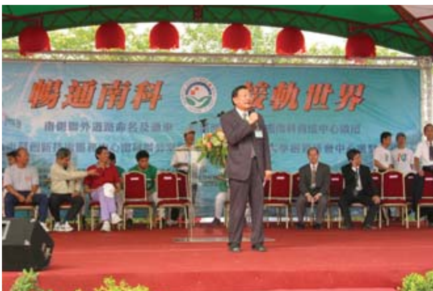
Figure 5-3-12 Director-general Tai Spoke during the Road-opening Ceremony for Southern Access Road