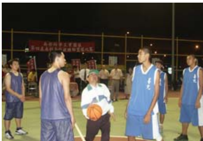
Figure 5-3-10 Director-general Tai Threw the First Pitch