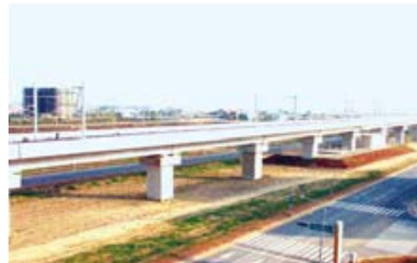
Figure 5-3-7 Tainan Science Park Section of High Speed Rail

The area within 200 meters of the High Speed Rail is reserved for park enterprises not sensitive to vibrations. Measures have been taken to reduce the impact of vibrations on Tainan Science Park. The phase 2 development of Tainan Science Park has been expedited to accommodate park enterprises. The winner of the Vibration-Reduction Project were chosen on August 17, 2003. Proposals were submitted by the end of December to serve as references for National Science Council to take necessary measures to protect park enterprises from vibrations.