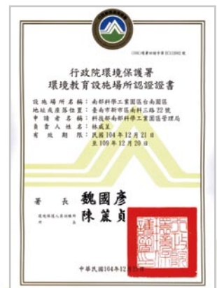
▲ Certificate of Environmental Education Facility of the TSP (December 21, 2015)