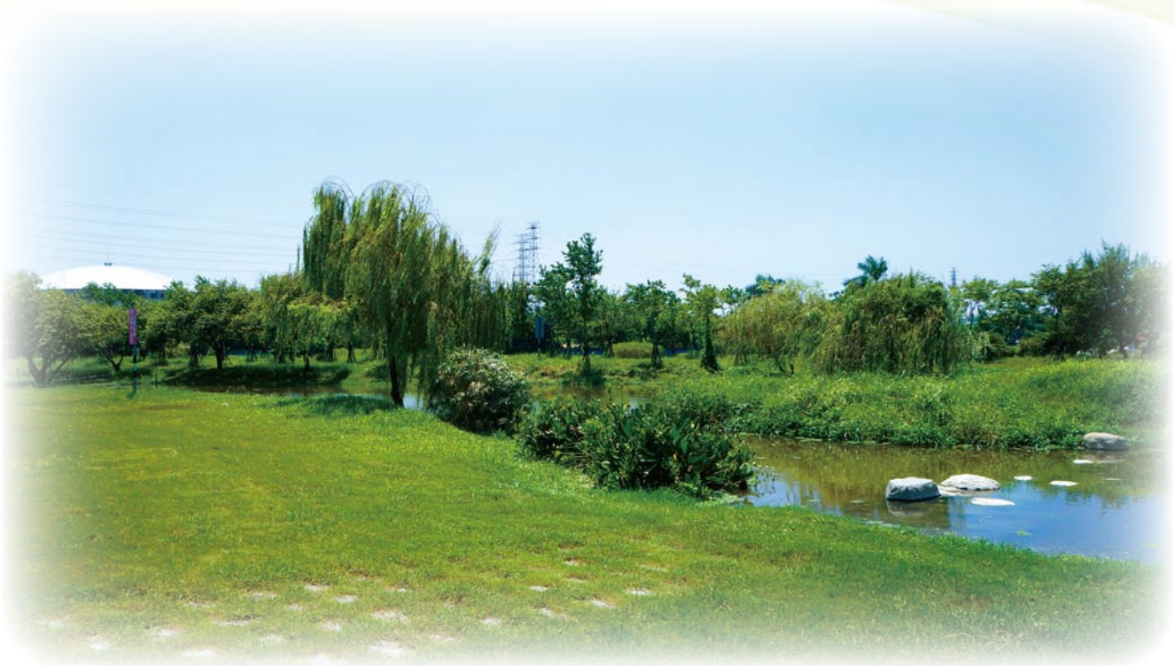
▲ Surrounding Environment of Waste Water Treatment Plant at the KSP