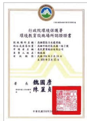
▲ Certificate of Environmental Education Facility of the KSP (March 16, 2015)

The STSP has rich natural ecological resources, historical monuments, art culture, and sound environmental protection facilities. In the STSP, Environmental Protection Center, Xiake Lake, ecological conservation area, Resource Recycling Center, Emergency Response Center, Archaeological Artifacts Exhibition Room, and Xingangshe Culture Center are all featured environmental education facilities within the TSP. At the initial stage, the STSPB applied for environmental education facility certification for the Environmental Protection Center and Resource Recycling Center. On December 21, both were officially certified. In the future, courses on natural conservation, water environmental ecology, and cultural conservation will be gradually developed.