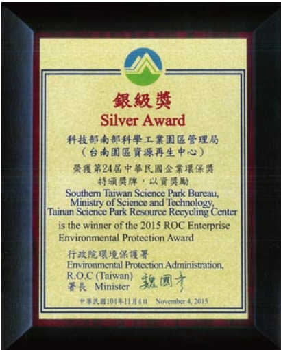
▲ The Resource Recycling Center won Enterprises Environmental Protection Silver Award

After recognized by Ministry of Economic Affairs (MOEA) with “Outstanding Award of Energy Conservation” in 2013, the Resource Recycling Center on November 4 won “the 24 th ROC Enterprises Environmental Protection Silver Award” given by the Environmental Protection Administration (EPA), the first winning science park in Taiwan. The STSP was also the first winner among waste treatment institutes in industrial parks. The honor was the other recognition to the Resource Recycling Center as well as a big encouragement for environmental protection promoted by the STSP.