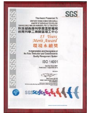
▲ Winning of ISO 14001 Sustainability Award of Environmental Protection Center (October 1, 2015)

The Environmental Protection Center at the TSP was certified with ISO 14001 Environmental Management System in August, 2001. In pursuit of concepts including “legal compliance, pollution prevention, continuous improvement, and comprehensive promotion,” the Environmental Protection Center implemented overall environmental policies. It passed re-examination and external audit of ISO 14001. At the 15 th anniversary of certification, the Environmental Protection Center on October 1 received ISO 14001 Sustainability Award.