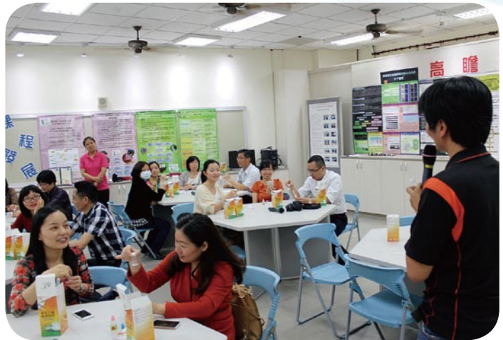
▲ Briefing of High Scope Program Given by Director of Academic Affairs to Principal and Teachers of Guangzhou Tieyi Center (March 30, 2015)