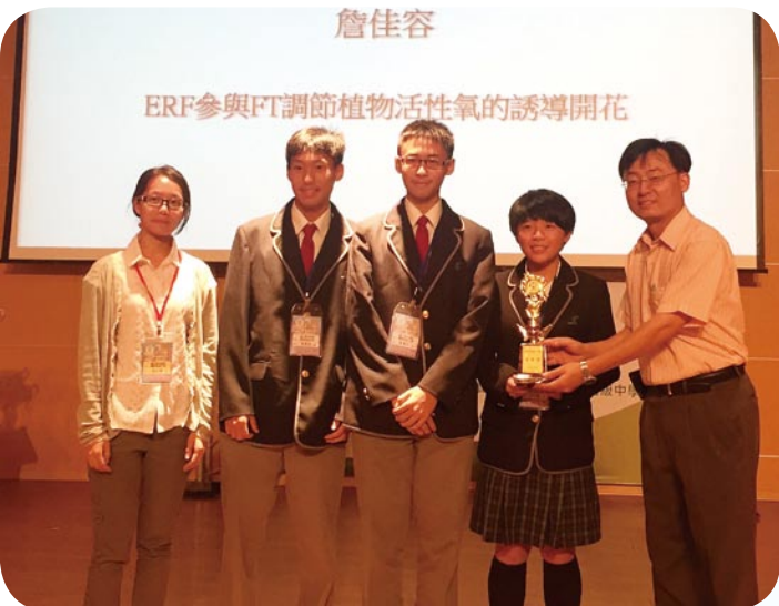
▲ Winning Award of Excellence, the Golden Prize, and Silver Prize for Result Presentation of 2015 Foresight Project Researches

Since School Year 2012, the NNKIEH cooperated with Kaohsiung Municipal Senior High School and National Taitung Girls' Senior High School to apply for the integrated project. I-Shou University was invited to be the Co-Principal Investigator to develop highlighted curriculums. Until School Year 2014, three set of mature module courses were developed to benefit teachers and students. The results were presented to 13 high schools and vocational high schools around Taiwan.