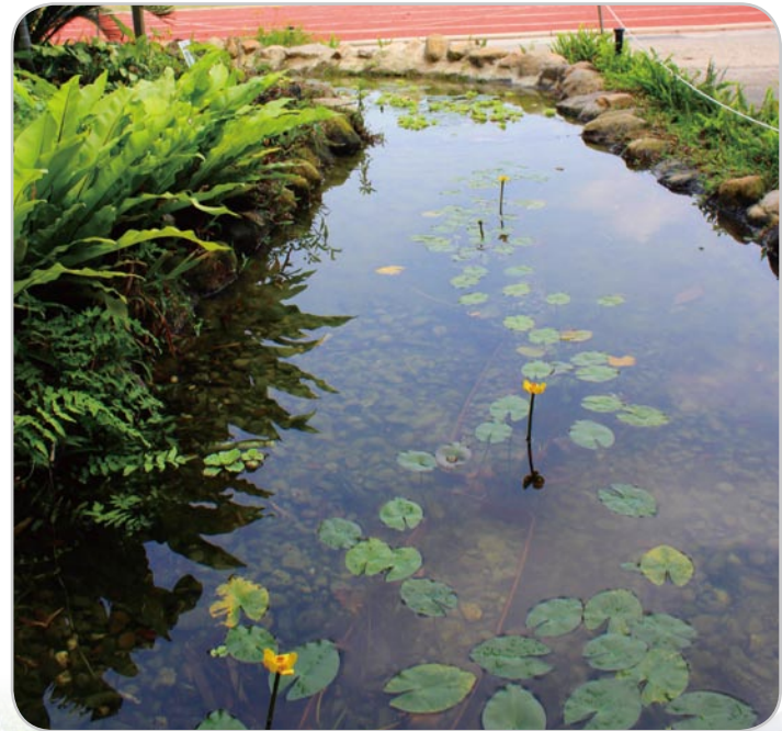
▲ First Flower Blooming of Yellow Water Lily at Subtropical Rainforest at the Elementary Department of NNKIEH (March 17, 2015)