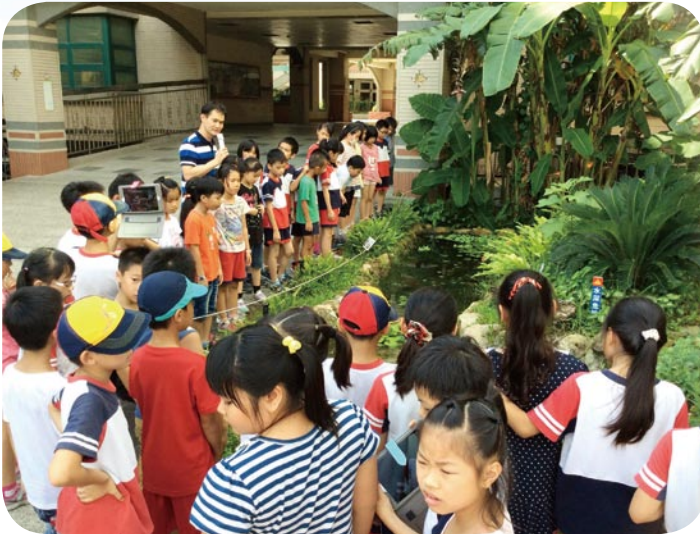
▲ Introduction to Subtropical Rainforest to Students of Elementary School (October 22, 2015)