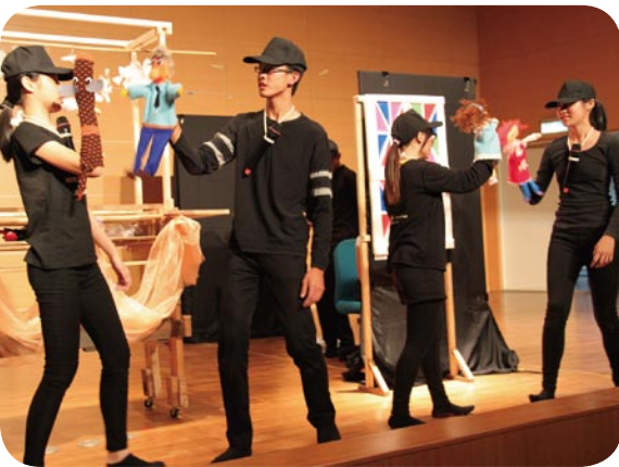
▲ Participation in National Student Creativity Drama-Hand Puppet Play (April 21, 2015)

In terms of Sports, the male Tennis team from the Junior High Department was awarded with the fourth place in the 2015 National High School Games, and the male and female Tennis teams from the Senior High Department were both the sixth place. The Bronze Prize was given to the female player from the Senior High Department.