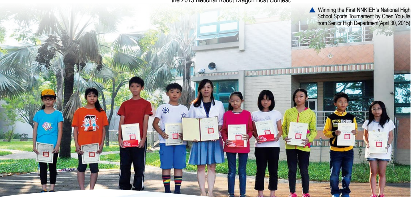
▲ Outstanding Performance in the 2015 Tainan City Language Contests (September 6, 2015)