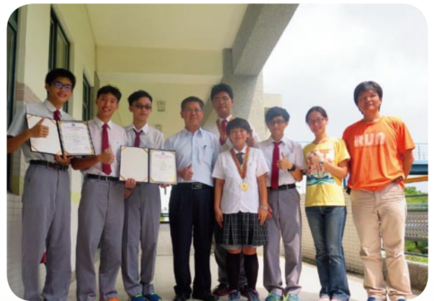
▲ Participation of Senior High School in International Exhibition for Young Inventors; Photo of Students Receiving Awards, Principal, and Instructors (September 28, 2015)

In 2015, NNKIEH students demonstrated outstanding interdisciplinary performance and received awards in both domestic and international contests. In terms of music skills, the Chorus of the Junior High and Elementary Departments were awarded with the Outstanding Honor of Group B; for scientific contests, the Senior High Department was awarded with the Second Prize of Botany and the Third Prize of Math in the 2015 Taiwan International Science Fair. In the 2015 International Youth Invention Exhibition, the NNKIEH respectively received Golden, Silver, and Bronze Awards. The Second Prize of Math was given to the Junior High Department in the 55 th Junior High School Science Fair.