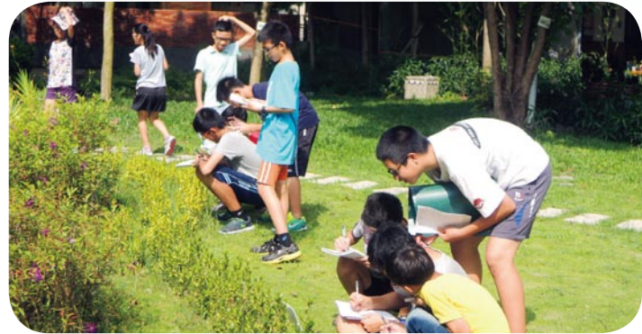
▲ Observation Records of Shrub Garden in Biological Class of Students of Junior High School (September 18, 2015)