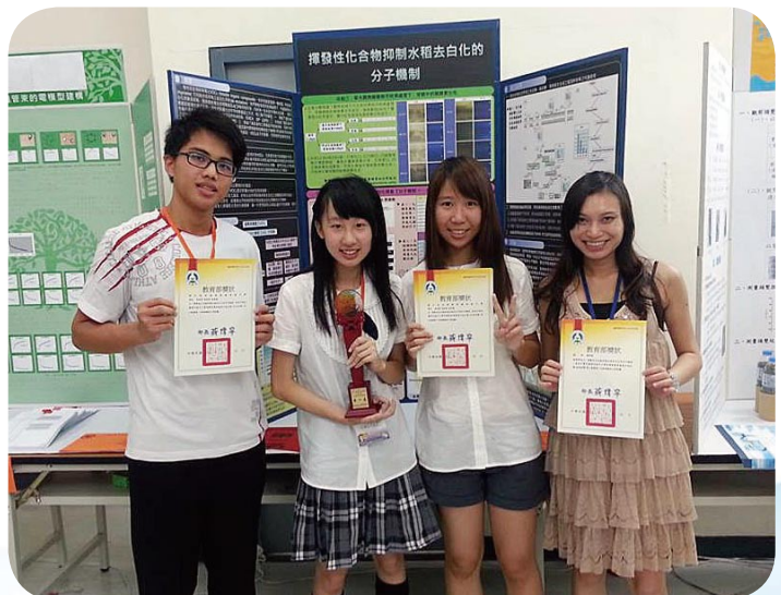
▲ The First Place Prize of the 53 th National Science Fair