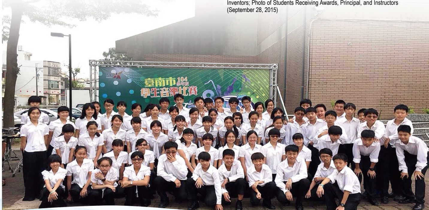
▲ Participation of Junior High Department in Tainan City Students Music Contest (November 10, 2015)