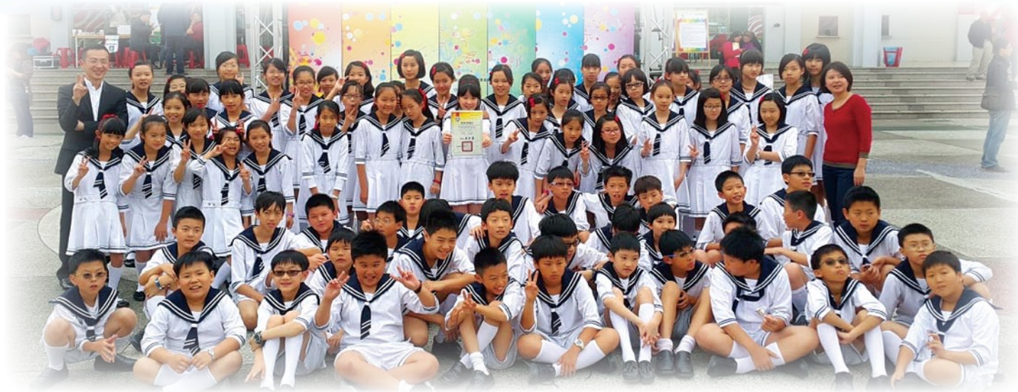
▲ Participation of Elementary Department in the Final Round of National Music Contest (March 12, 2015)