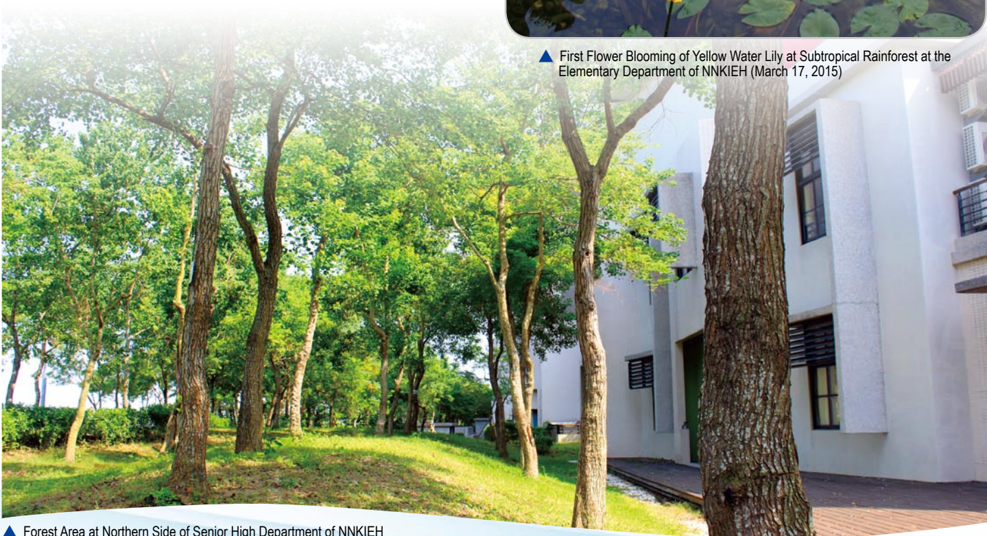
▲ Forest Area at Northern Side of Senior High Department of NNKIEH

The NNKIEH's Green Project entered its third year at the "growth stage." In 2015, coordinating with the Foresight Project and Campus Aesthetics Environment Rebuilding Project, continuous focuses were placed on caring for ecological environment and promotion of green technology education. Promotion achievements have gradually been recognized by schools around Taiwan. Many came to visit the NNKIEH campus with the accumulated number of visitor reaching 2,500.