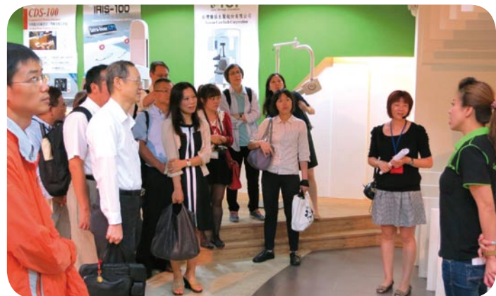
▲ Introduction to Company Products and Quality by Park Enterprises at Medical Device Exhibition Room (August 31, 2015)

In order to overcome barriers of sales and marketing of the medical device industry, the STSPB coordinated with the “One Alliance at One Center” policy of Ministry of Health and Welfare to implement the operation of industrial alliance, modularization, and commercialization services. The “STSP Industrial Alliance of MIT Medical Device Products” was established to encourage hospitals to purchase MIT products and jointly promote exports of MIT products and medical services.