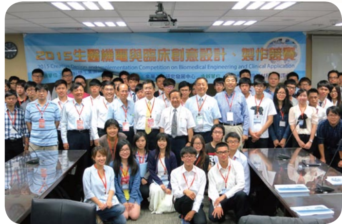
▲ TSBME Biomedical Innovation Event (May 15, 2015)

The Phase II Project of “Southern Taiwan Biomedical Device Industrial Cluster Development Plan” has successfully established the integrated service platform, the alliance between and among the industry, academia, and the research institutions, the key opinion leader (KOL) in marketing, and the innovative environment for the innovative medical device industry. In 2015, the presence of 5 project applicants at the STSP was approved, which made the number of approved enterprises now reach 49 with the total accumulated investment amount of NT$9.1 billion. In 2015, the turnover was NT$2.01 billion. In terms of grants to the innovative technologies, in 2015, 42 projects filed the applications. Among them, 19 were awarded of grants totaling NT$90 million and attracted about NT$90 million R&D investment from interested enterprises.