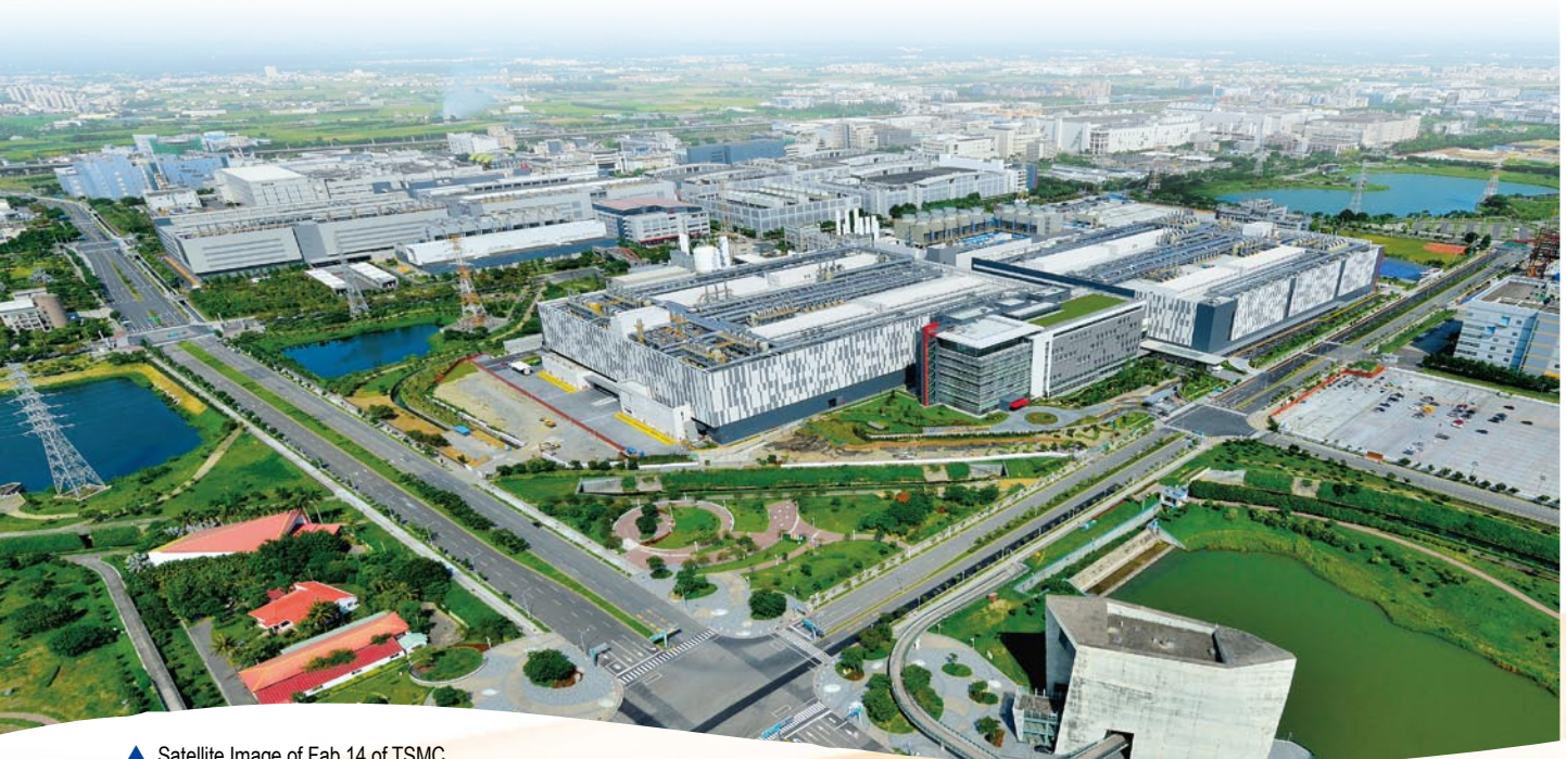
▲ Satellite Image of Fab 14 of TSMC

TSMC invested continuously more than NT$500 billion in the process technology under 20 nanometers at FAB 14 of Phase 5-7 at the TSP. Phase 5-7 and the Advanced Packaging Foundry now began mass production. UMC invested continuously more than NT$240 billion in the process technology under 28 nanometers at Phase 5 and 6 factories of FAB 12A at the TSP while Phase 5 began installation this year. The increasing investment of two leading wafer plants attracted the presence of upstream and downstream suppliers nearby and made the STSP the location with the largest number of global 12-inch wafer foundries.