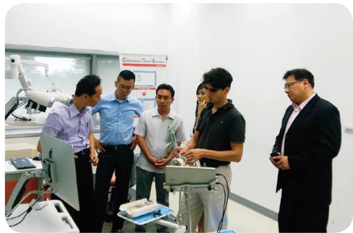
▲ Visit of Physicians from Vietnam to Park Enterprises of Medical Device (November 2, 2015)