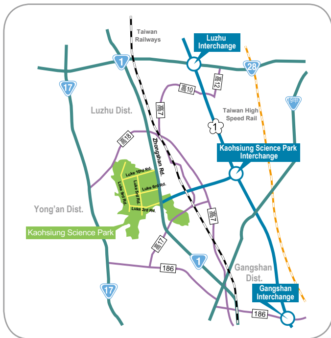
▲ Information Map of KSP

The Kaohsiung Science Park(KSP) is located at the border of Luzhu, Gangshan, and Yong'an Districts in Kaohsiung City with the area of 570 hectares. It is the home of optoelectronics, precision machinery, and biotechnology (medical device) industries. The Kaohsiung Science Park can be accessed by exiting at the Kaohsiung Science Park Interchange of National Freeway No.1. Visitors can also take Taiwan Railways and disembark at Luzhu and Gangshan Station. Alternatively, visitors can take Taiwan Provincial Highway No.1 to get to the Kaohsiung Science Park. Transit Bus Red 69B of Kaohsiung Mass Rapid Transit (KMRT) is also available. In the future, the KMRT will extend its line to Luzhu in order to improve traffic access. It is about 35 kilometers from the Kaohsiung Science Park to Xiao gang International Airport and about 40 kilometers from the Kaohsiung Science Park to Kaohsiung Port. Hence, the Kaohsiung Science Park enjoys great geographic advantages in regard to international transportation.