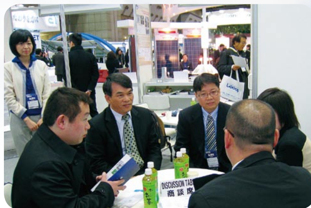
■ The STSP Pavilion in “The 7 th PV EXPO” Attracting Visits of International Enterprises (February 26, 2014)