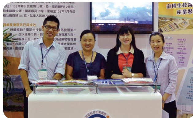
■ The STSP Pavilion at “The Bio Taiwan 2014 Expo”(July 24, 2014)

“The Bio Taiwan 2014 Expo” was launched at the TWTC from July 24 to 27. The STSPB led nine Park enterprises and the Metal Industries Research and Development Center to set up the STSP Bio Pavilion at the expo attracting the visits of domestic and international channel members and enterprise representatives and successfully promoting the biotechnology industry at the STSP.