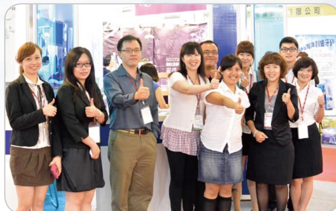
Professional and Good Quality Provided by the STSP Representatives at Tainan International Biotech & Green Energy Exposition(September 12, 2014)

From November 23 to 27, six Park enterprises were invited to Ho Chi Minh City, Vietnam for the event of “KOL Marketing under the Academia-industry Cooperation of the Medical Device Industry in Vietnam.”