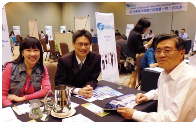
One on One Meeting at the Santa Clara Conference Center in Silicon Valley (October 19, 2014)