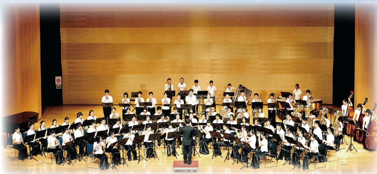
■ Continuous Outstanding Performance of the Concert Band of the Junior High Department (March 7, 2014)