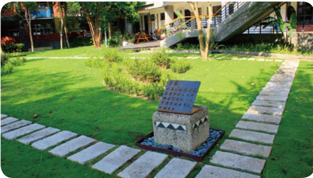
■ The Ecology Learning Trail and Poem Signs in the Bush Garden

Under the Green Project, the NNKIEH realized its goal of building the green campus. The PV system installed on the top of campus buildings improved the issue of high temperature and at the same time generates the electricity up to 39.5kW. The circulation system of the ecological tank at the Junior High Department introduced the underground water source, and with the installation of the filter system, the vigorous eco-system was developed. The ecological learning corridor of shrub garden was remodeled among Building A, B, and C at the Junior High Department. There inside were plants such as China Rose, Blackberry Lilly, Common Crapemyrtle Flower and Rose Moss, with a marble trail. Signs written with Chinese poems of the Tang and Sung Dynasties were also installed.