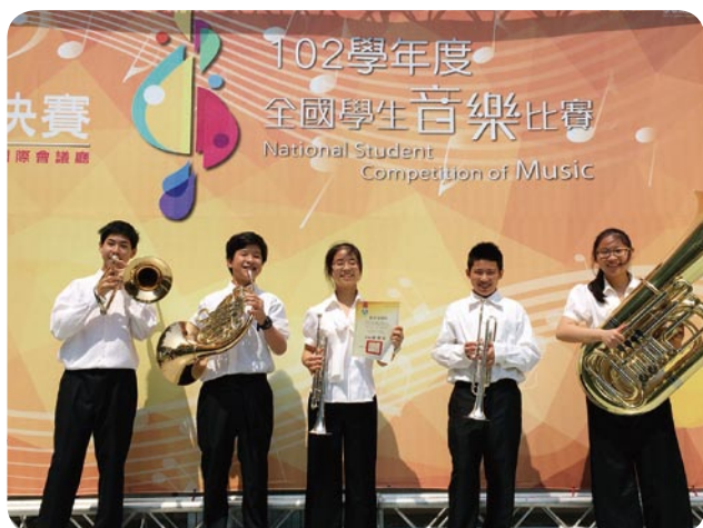
■ The First Place of Group B of Brass Quintet in "National" Student Music Contest Awarded to the Junior High Department (March 7, 2014)

For scientific education, the Junior High Department was awarded with the first place in Group 1 in the 54 th Junior High School and Elementary School Science Fair; the Senior High Department was awarded with the third prize of Botany in the 2014 Taiwan International Science Fair; and the Bronze Award was given to the Senior High Department in the 2013 International Women Inventors Exposition (KIWIE).