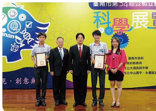
■ The First Place Award of Junior High School Math Group of the 54 th Science Fair Given by Tainan City Mayor, Mr. Lai Chingde (the Third from the Right) (May 15, 2014)