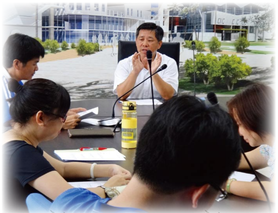
■ The Promotion Group Meeting for Teachers' Professional Development (July 19, 2014)

Since School Year 2012, the NNKIEH participated in the teachers' evaluation program for professional development promoted by Ministry of Education. In School Year 2014, the number of teachers at the Senior High Department who passed the initial accreditation reached 100%; the applications of six teachers from Senior High Department and Junior High Department for the advanced evaluation of teachers' professional development were also passed. In School Year 2013, teachers at the Elementary Department also participated in teachers' evaluation program for professional development.