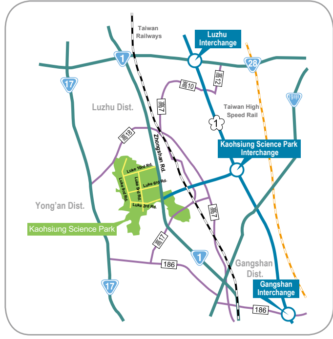
Traffic Map of the Kaohsiung Science Park(the KSP)