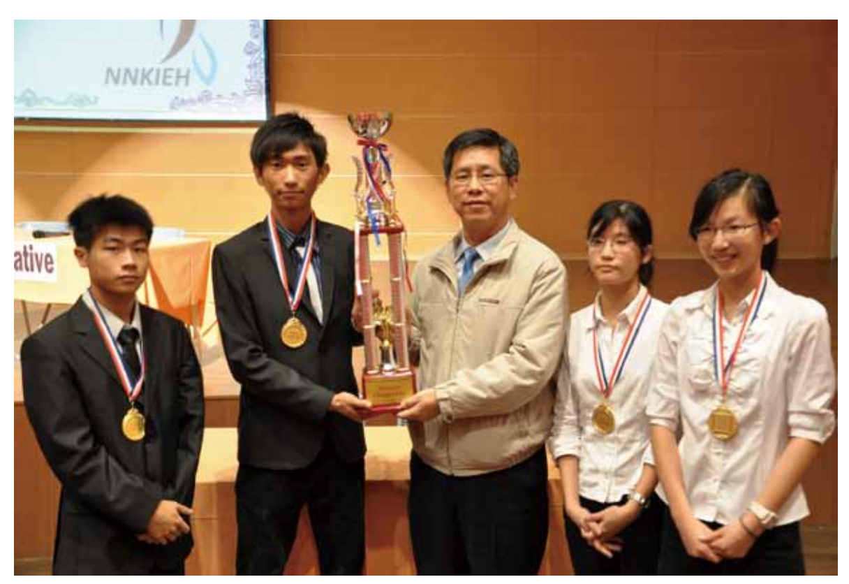
▲ STSP Cup English Debate Contest Champion, the Bilingual Department of the NNKIEH (March 19, 2011)