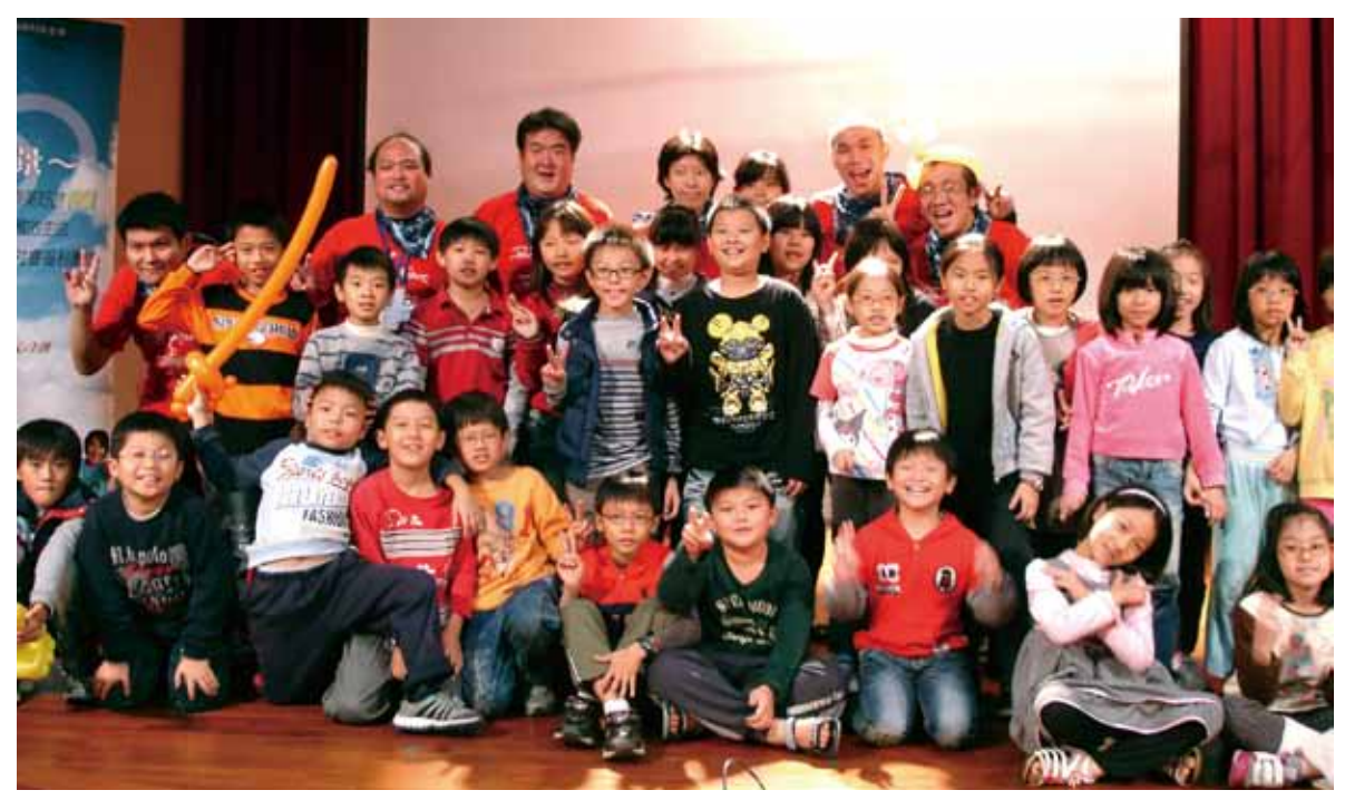
▲ Photo of Special Education Promotional Activities at the NNKIEH Organized by the Syin-Lu Social Welfare Foundation (December 6, 2011)

NNKIEH has two libraries: the Senior High Department's Central Library and the Elementary Department's Branch Library. Both are devoted to the encouragement of reading. On average, each NNKIEH student borrows more than 25 books, its students were the winners of off campus reading reflection contests in 2011. For example, in "Reading 100 on the 100th Anniversary of the R.O.C." Youth Reading Reflection Contest, NNKIEH's Elementary Department Senior Year Group won second place while the Junior High Department won third prize with three articles selected in