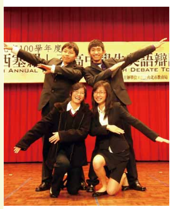
▲ Photo of the NNKIEH Bilingual Department's Debate Team at Taipei WEGO Private High School (December 27, 2011)