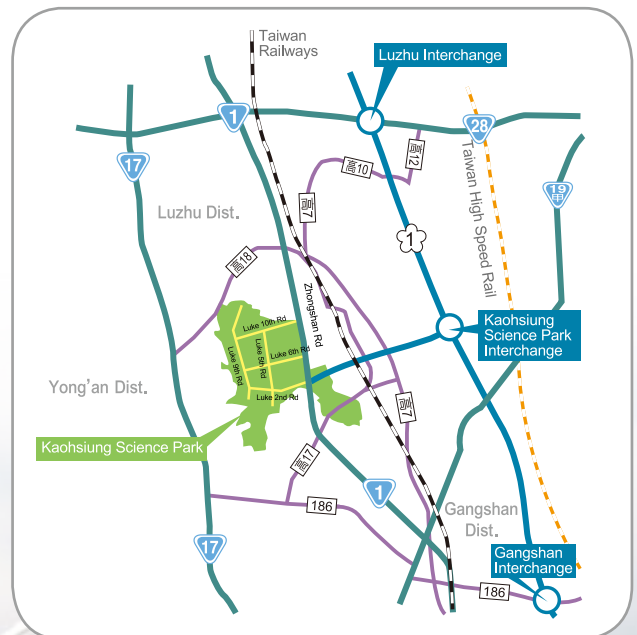
Kaohsiung Science Park (KSP) Traffic Map