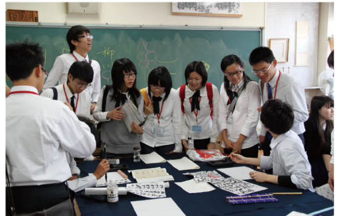
Observation of a Calligraphy Class During the Study Tour of NNKIEH Students to Semboku High School, Japan (April 21, 2010)

Besides exchanges with Japanese sister schools, in summer 2010, 27 members of the NNKIEH Wind Band went to Canada to participate in the UBC Summer Music Camp with students from around the world. In addition to learning music, NNKIEH students improved their English proficiency and experienced different cultures. The Music Camp also arranged for students coming from all parts of the world to perform together in mixed music styles. NNKIEH students took the chance to perform and introduce Taiwanese songs such as "Song of the Spring Breeze," "An Old Train Song," and "Formosa" at the world class Chan Centre in Vancouver. Their performance also won much applause from the audience.