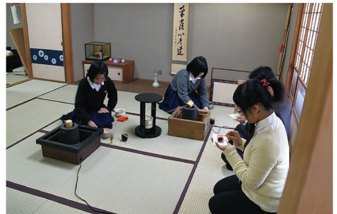
Observation of a Tea Ceremony of NNKIEH Students in Semboku High School, Japan (April 21, 2010)