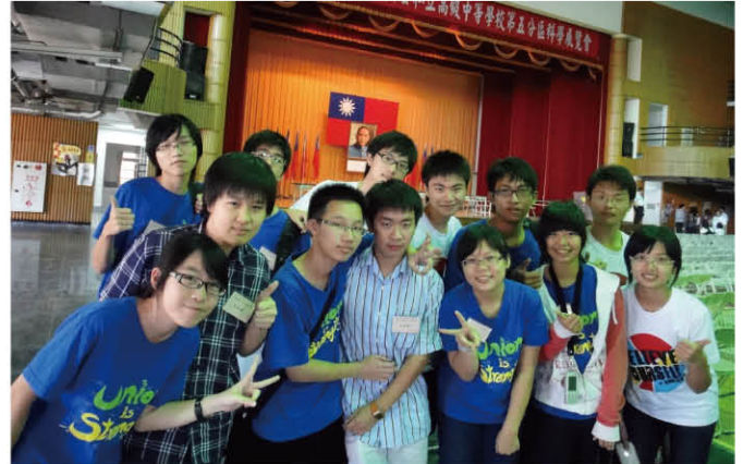
Four Groups of Winners in the First Participation of the Senior High Department of NNKIEH in the Science Expo and Contest (May 4, 2010)