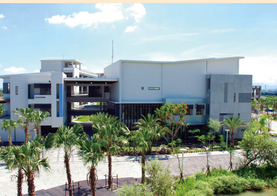
▼ NNKIEH is the first school obtained the Diamond Level Green Building Labeling in Taiwan

Record breaking scores to be admitted to NNKIEH have been witnessed year by year. The scores to be admitted to the Senior High Department increased from 260 (full score 312) in School Year 2008 to 377 (full score 412) in School Year 2009, to 393 (full score 412) in School Year 2010, jumping to the highest admission scores in Tainan area. Many students see the future potential of NNKIEH and rank it as the top school that they choose to study at.