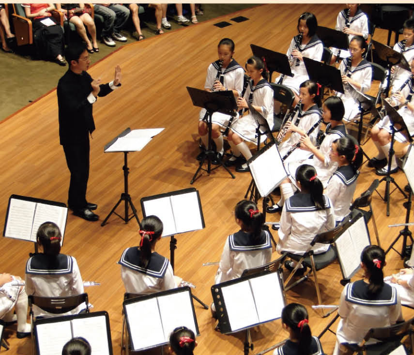
▼ The "A Day at the Circus" Concert Featuring the Wind Band of NNKIEH at the Tree Valley Music Hall (May 19, 2010)