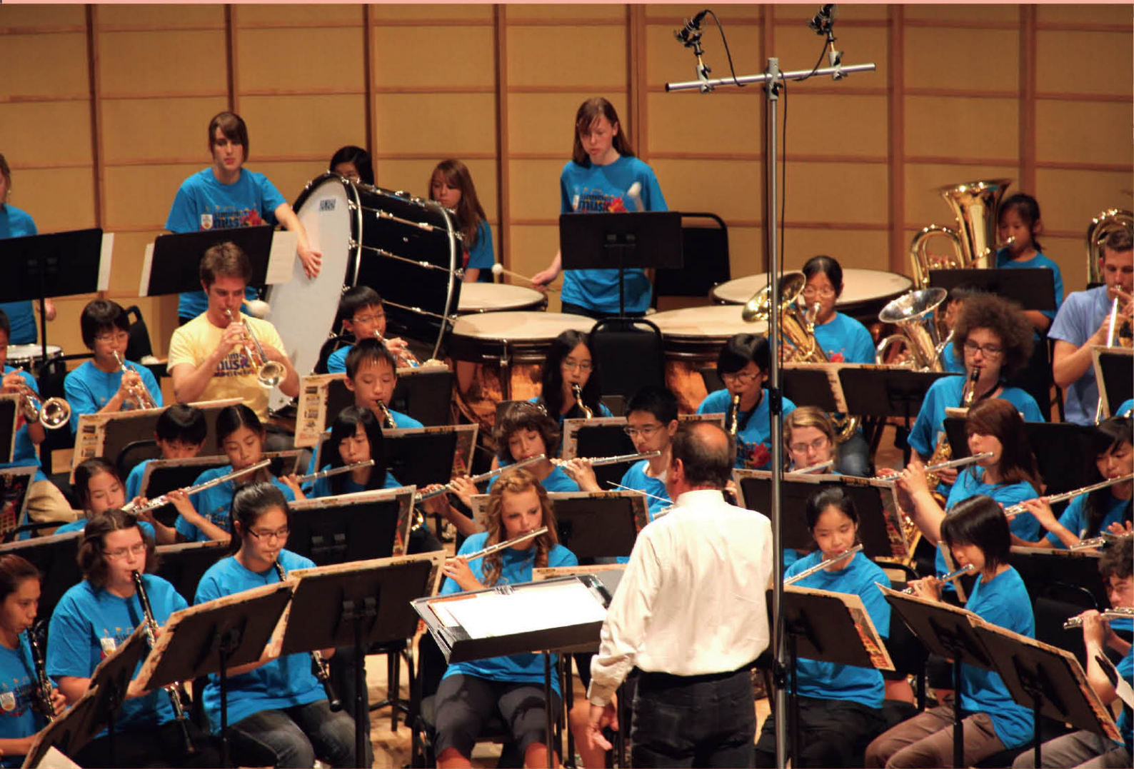
▼ The Joint Performance of the Wind Band of NNKIEH and the Youth Around the World at the Summer Music Camp of UBC, Canada (July 17, 2010)