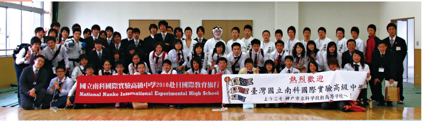
Exchanges Between Kobe Science and Technology High School and NNKIEH (April 19, 2010)

Canada were also invited to perform. A loud applause was heard from the fully occupied seats in appreciation of their wonderful performances.