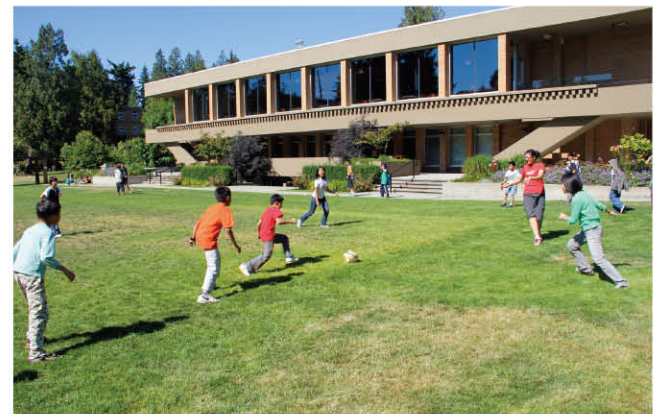
Participation of NNKIEH Wind Band in the Outdoor Activity of Summer Music Camp, UBC, Canada (July 16, 2010)