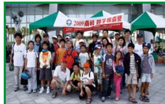
Photo of Parents and Children at the "STSP Parent-Children Ecological Exploration Camp" (October 25, 2009)