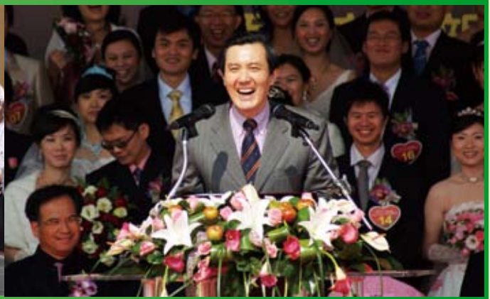
Opening Remarks Delivered by President Ma at the Sixth Anniversary Celebration of the STSP Administration (January 10, 2009)