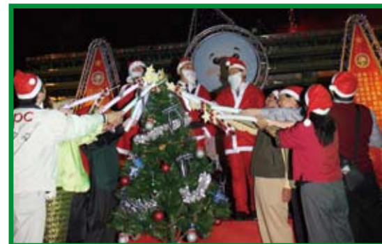
Lighting Ceremony and Prayers with Distinguished Guests (December 24, 2009)

The STSP Administration, for the first time in 2009, organized a series of activities on "Exploration at the STSP—Educational Promotion." In June, two groups of "Exploration Camp of Environmental Protection of School Kids" and in October, a "Parent-Children Ecological Exploration Camp" were held that involved interaction between parents and their children and hands-on experiences to demonstrate the features that made the STSP a Green Science Park with its focus on "clean production, comfortable lifestyle, and rich ecology."