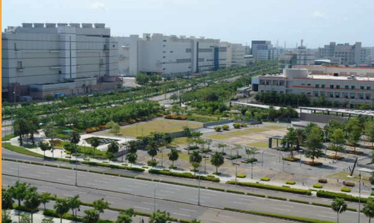
▲Tainan Science Park(TSP)