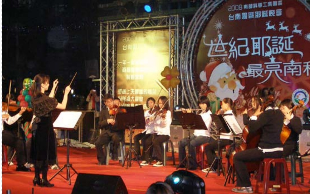
▲ Concert at the Christmas Party