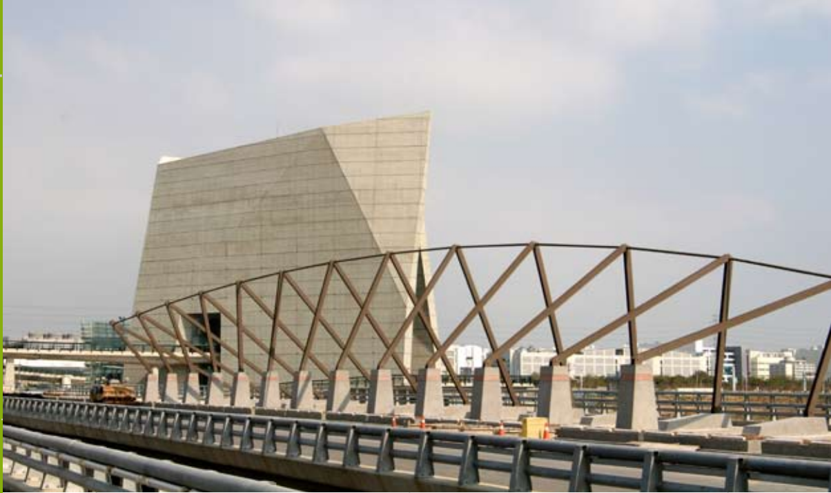
▲The 4th elevated water tank at the west entrance of TSP is an impressive landmark.