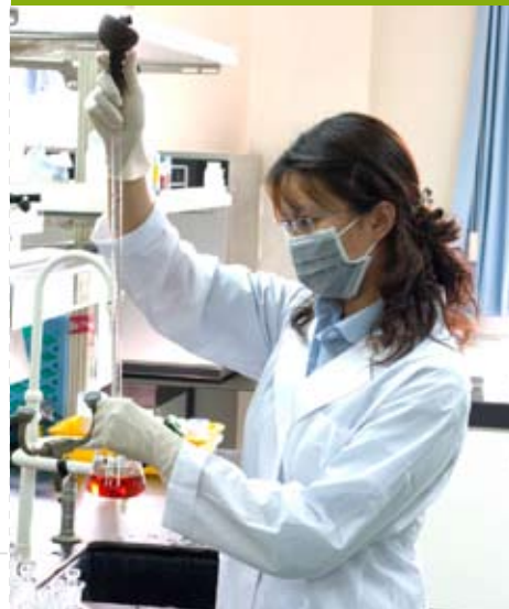
▲ Water analysis and test of the Environmental Protection Center