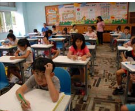
▲ The Beauty of the STSP-students’ art contest during the Occupational Safety & Environmental Protection Month

The Environmental Analysis Laboratory of the STSP’s Environmental Protection Center (Waste Water Treatment Plant) in TSP was certified by the Environmental Analysis Laboratory, EPA in 2002. It was reevaluated by the EPA in April 2008 for the extension permit of water quality test and 7 heavy metal water quality tests. 15 certificates were received in total including water temperature, conductivity, suspended solids, dissolved oxygen, hydrogen pH, biochemical oxygen demand, chemical oxygen demand, fluoride, cadmium, iron, nickel, manganese, copper, zinc, and chromium test. The STSP’s waste water treatment capability has dramatically improved.