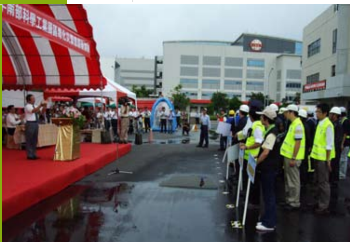
▲ The STSP's toxic disaster drill was highly praised by the drill observers.

The system was used to delegate the rescue team effectively during the gas leakage incident by one of the Park's telecommunications enterprise. The gas leakage promptly controlled, and avoiding any injury or death. The incident demonstrated the STSP's capacity to successfully respond to emergency.