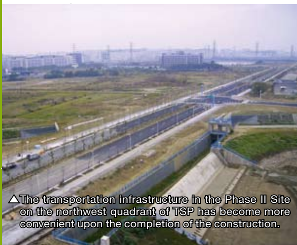
▲The transportation infrastructure in the Phase II Site on the northwest quadrant of TSP has become more convenient upon the completion of the construction.

The construction of the 4-kilometer expressway interchange connects KSP to National Highway No.1 includes two phases – road and overpass. Each phase