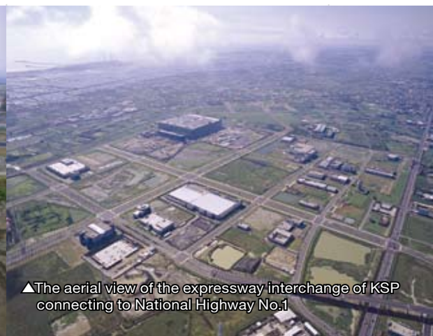
▲The aerial view of the expressway interchange of KSP connecting to National Highway No.1