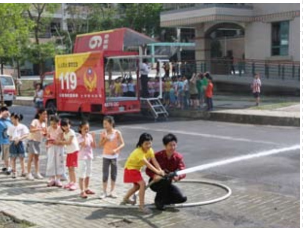
▲ The fire fighters were educating students on how to put out a fire during the “2008 National Nanke International Experimental High School – Junior Fire Fighters Passport” event.

The STSP Administration arranged Occupational Safety & Environmental Protection Month Activities on September 6-25, 2008 in accordance with the STSP’s excellent tradition and culture of occupational safety and environmental protection. The activities provided a forum