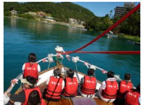
▲ Japanese friends toured the Sun Moon Lake to appreciate Taiwan's nature beauty.