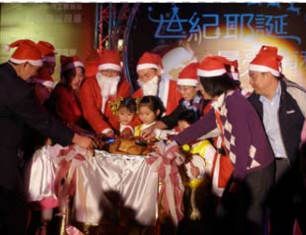
▲ Enjoying the turkey meal at the Christmas Party in TSP