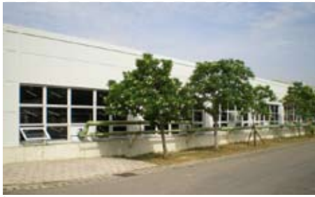
▲ The construction completed for aeration tank cover of the Waste Water Treatment Plant.

The aeration tank cover of the Waste Water Treatment Plant in the Phase I Site