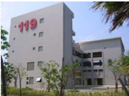
▲ The fire brigade building in TSP fosters the safety of the Park.

The completed transportation network provides convenient transportation service in response to the massive passenger and cargo transportation demand, alleviates traffic jams on the expressway, controls the timing of high-tech imports/exports in and out of Kaohsiung International Airport, and is a crucial element in the newly improved comprehensive transportation infrastructure.