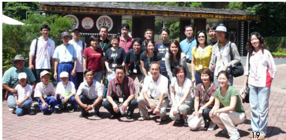
▲ The Taiwan indigenous culture tour with Japanese friends