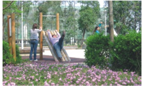
Sin Yuan, the Dom for Staffs with Families