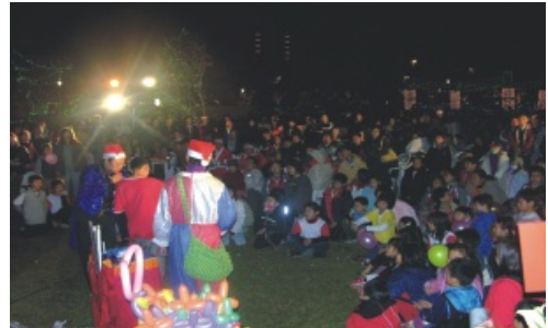
Christmas Lighting Party at Pusin Park (December 23)