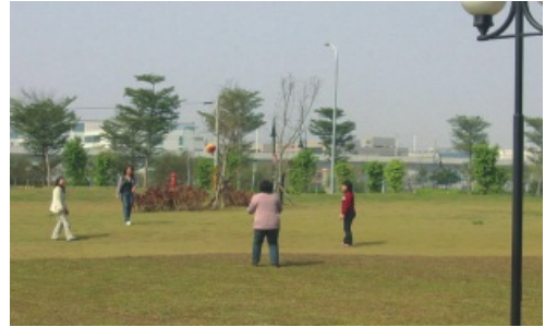
Pu Yuan, the Dorm for the Managerial Level

To build a beautiful landscape in the STSP, the STSP Administration planted flowers such as sun flowers and cosmos on the land which has not been leased out. During the blossoms, the beautiful flowers are very charming. In addition, to promote sustainable development and provide a platform for opinion exchange and experience sharing, four seminars on the building of green landscapes were held.