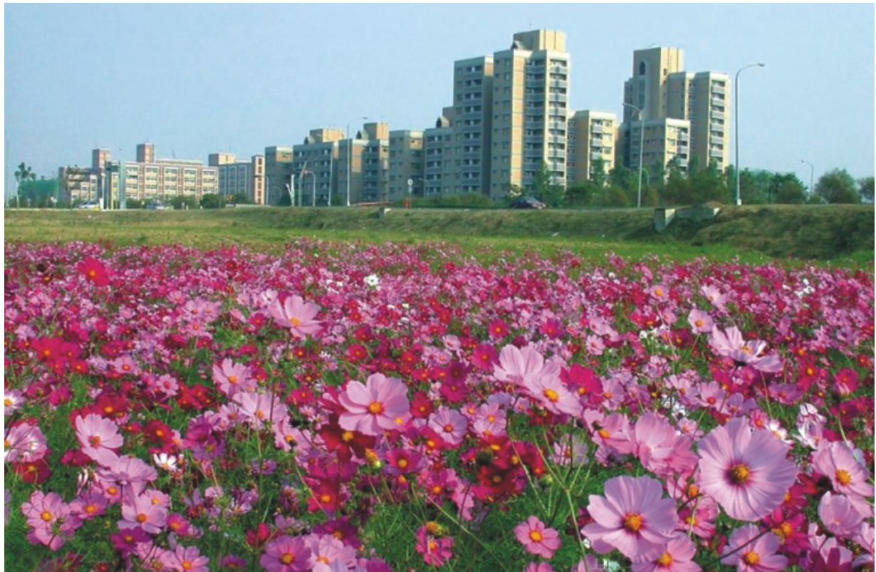
Cosmos Greeting the Wind