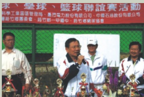
Opening Ceremony of Neighborhood Cup (December 25)